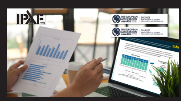
IPAF Rental Market Report 2023