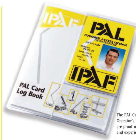
The PAL Card and Operator's Log Book are proof of training and experience.