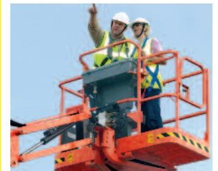
IPAF trains over 100,000 operators each year.