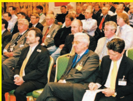
All IPAF members can attend our Summit free each year.