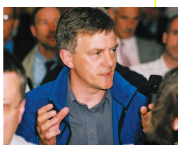
Special events inform – and provide opportunities to network.