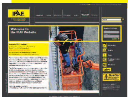
Our website keeps you up-to-date with what's happening in the world of powered access.