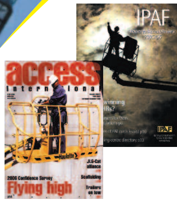
Access International which is free to IPAF members, plus IPAF's Powered Access Annual Magazine.

IPAF membership will bring you invaluable information, networking opportunities, significant savings, growth possibilities – and the respect of your industry.