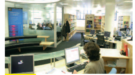
IPAF members can access the Business Information Service from the IOD.